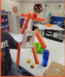
A "robot" DMPS made with tools discussed in Be a Maker .