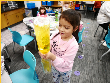
A kindergartener learns how to make a "tornado" during a visit by the Rosie team to Wright Elementary.